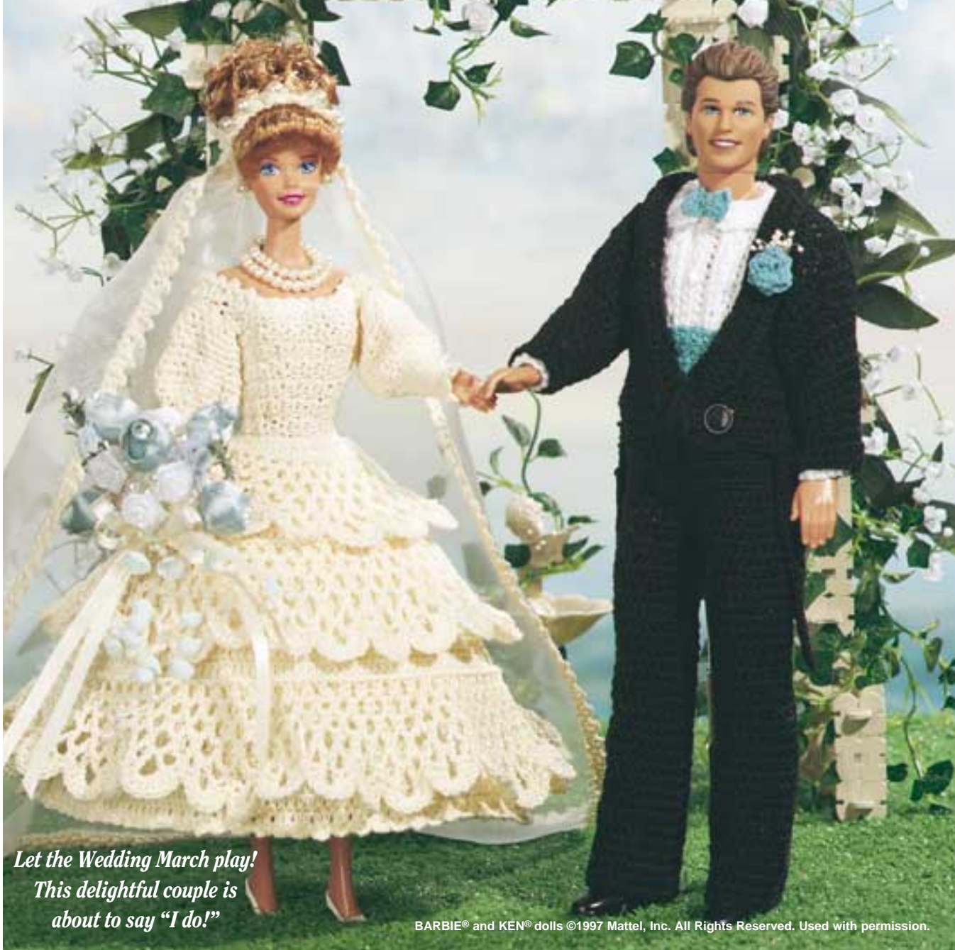
Let the Wedding March play! This delightful couple is about to say "I do!"

BARBIE® and KEN® dolls ©1997 Mattel, Inc. All Rights Reserved. Used with permission.